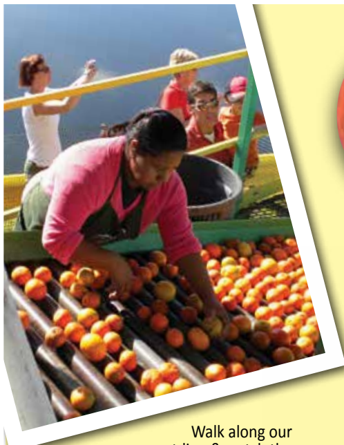
Walk along our wet-line & watch the fruit roll by!