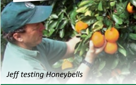
Jeff testing Honeybells

“The Al’s Family Farms Difference” means–We carefully hand pack your citrus with pride! Our packers are the best!